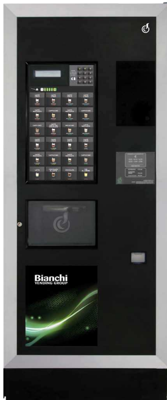
LEI500 M TACTILE SELECTION PANEL STT

LEI500 M, THE NEW DESIGN CONCEPT THAT OFFERS MODULARITY, FLEXIBILITY AND COMMUNICABILITY.