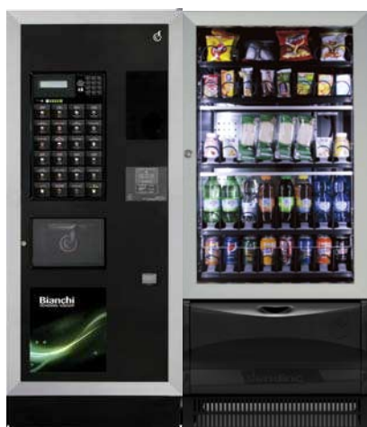
LEI 500 M DIRECT SELECTION PANEL + VISTA M